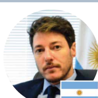
Facundo Marín "Implementation Model of the Transactional Electronic System in the Province of Salta"