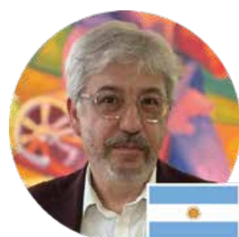
Horacio Corti "Public Procurement and International Human Rights Law"